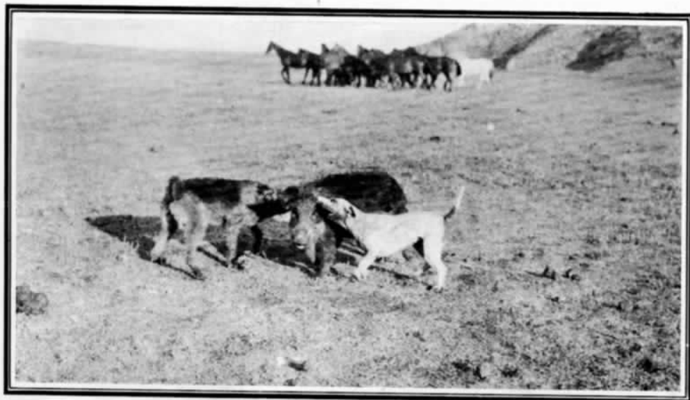
THE DOGS QUICKLY LEARNED HOW TO WORK TOGETHER IN FIGHTING THE DANGEROUS BOARS.

boar. If you remember a few basic principles you are as safe as a cow tied to a brick wall. The dogs prevent absolutely the animal's paying any amount of attention to you; when your knife strikes home, jump out of the way in case the animal shakes itself free momentarily; if by any remote chance it should charge in your direction, remember that a pig cannot run up-hill. Just make your escape up the slope, and you are all right.